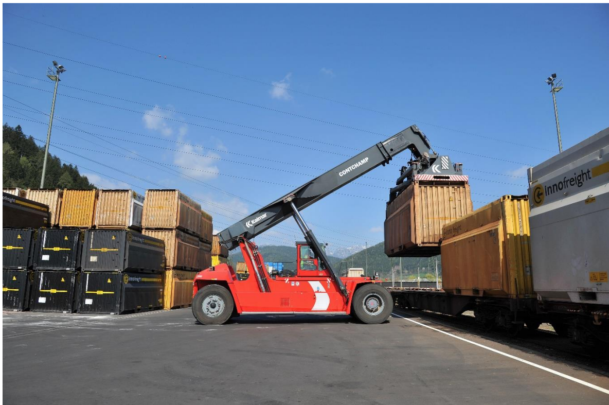
Terminal St. Michael