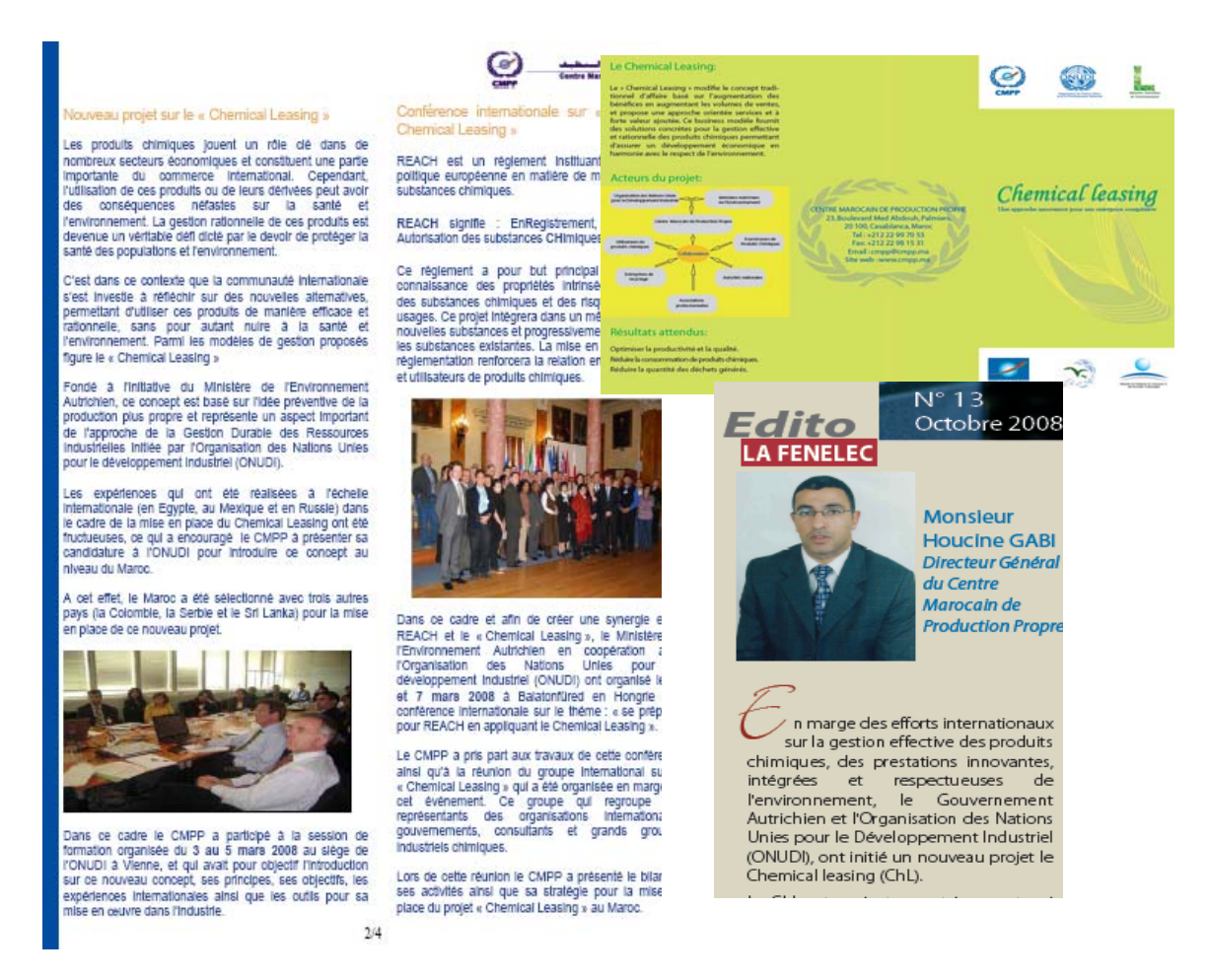
Promotion material for Chemical Leasing in Morocco

Workshop preparation and organisation and official launch of Chemical Leasing activities and projects