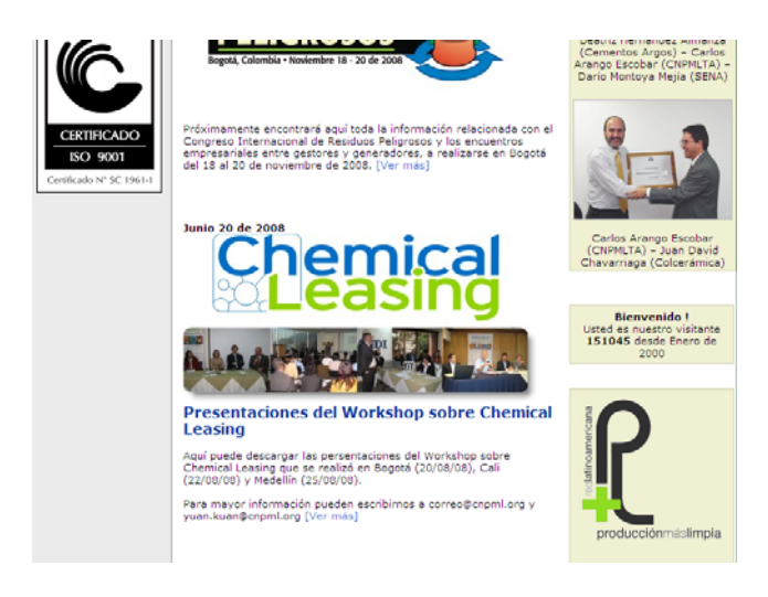
Screen shot of the NCPC Colombia homepage