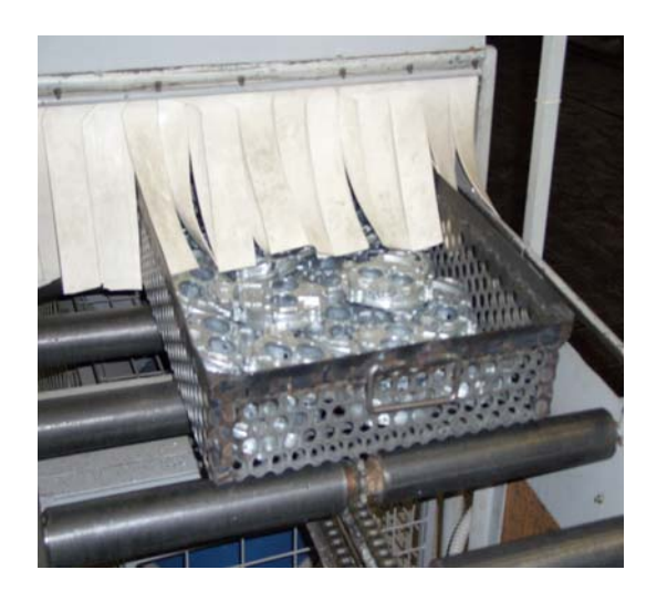
New drying chamber

In addition to that, the NWICPC had meetings with St. Petersburg Newspaper Complex (January 2008), with Ecros, Ltd. (May 2008), with Notech, Ltd., chemical producer and supplier (June 2008). The specialists and managers of these companies were informed about Chemical Leasing business models. The possibilities of Chemical Leasing application in these companies are now under analysis.