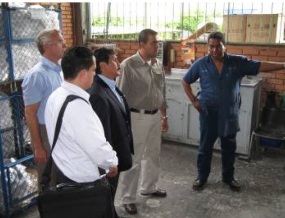
Company visits at GM Colombia and Roy Alpha.