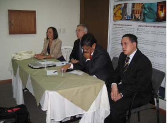
Workshops in Bogota, Cali and Medellin

Multiple site visits were conducted to companies from different sectors and letters of intent were signed by several companies. The following enterprises were visited during the mission: