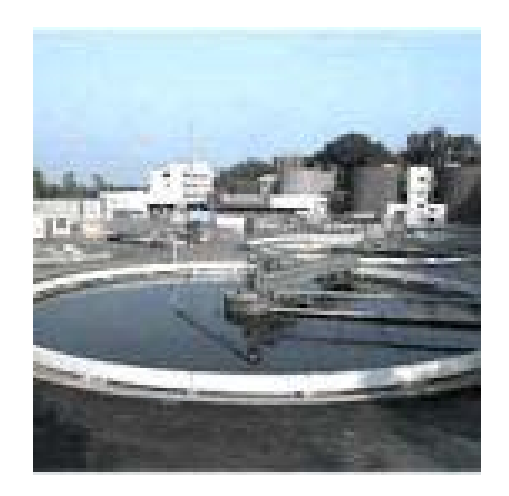
Water treatment plants in Russia

• <u>Cooperation with Fuel Systems Ltd. and Neftechem-Service on the building of a new sparge water purification line CP and CP'+'.</u>