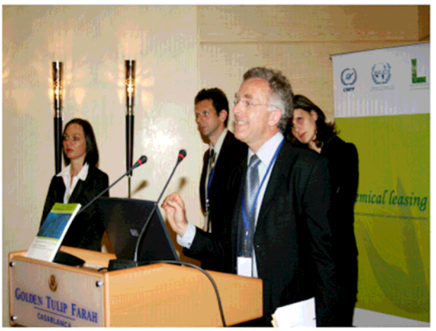
Launch of Chemical Leasing activities in Morocco