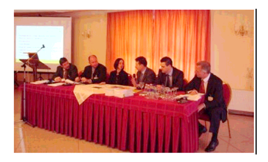
Panel discussion on Chemical Leasing and REACH in Balatonfüred

The conference took place in Balatonfüred, Hungary on March 6-7. The meeting was initiated by the Austrian Federal Ministry of Agriculture, Forestry, Environment and Water Management in cooperation with the Hungarian Government and UNIDO. The conference aimed at presenting Chemical Leasing as a promising approach towards REACH compliance and at identifying potential pilot projects. Approximately 80 representatives of the private and public sectors from more than 10 countries participated in the conference. At this event the book "Chemical Leasing goes global" was officially presented, which was jointly published by UNIDO and the Ministry of Environment of Austria. The program and a comprehensive report of the conference can be found at <a href="http://www.chemicalleasing.com/conference.htm">http://www.chemicalleasing.com/conference.htm</a>.